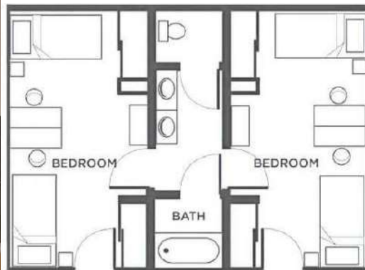
This is an example of the concept Jack and Jill